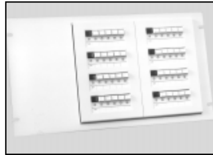
RMK-02: Fits LA-40AS, LD-40AS, N-40AS, ND-40AS