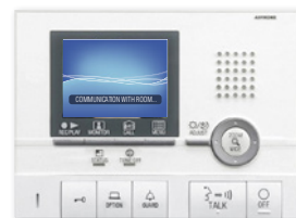
GT-2C Tenant Station