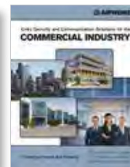
Commercial Market Brochure #99586