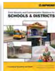
School Market Brochure #99579