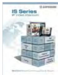
IS Series End User Brochure #95221