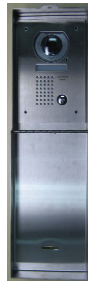
SBX-LSE open w/camera